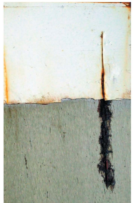
BLANK (no inhibitor)