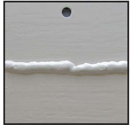
3% HALOX® 570 LS

NOTICE: Although the information and recommendations set forth herein (hereinafter "Information") are presented in good faith and believed to be correct as of the date hereof, ICL Advanced Additives ("ICL") makes no representations or warranties as to the completeness or accuracy thereof. Information is supplied upon the condition that the persons receiving same will make their own determination as to its suitability for their purposes prior to use. In no event will ICL be responsible for damages of any nature whatsoever resulting from the use or reliance upon Information or the product to which Information refers. Nothing contained herein is to be construed as a recommendation to use any product, process, equipment or formulation in conflict with any patent, and ICL makes no representation or warranty, express or implied, that the use thereof will not infringe any patent. NO REPRESENTATIONS OR WARRANTIES, EITHER EXPRESSED OR IMPLIED, OF MERCHANTABILITY, FITNESS FOR A PARTICULAR PURPOSE OR OF ANY OTHER NATURE ARE MADE HEREUNDER WITH RESPECT TO INFORMATION OR THE PRODUCT TO WHICH INFORMATION REFERS.