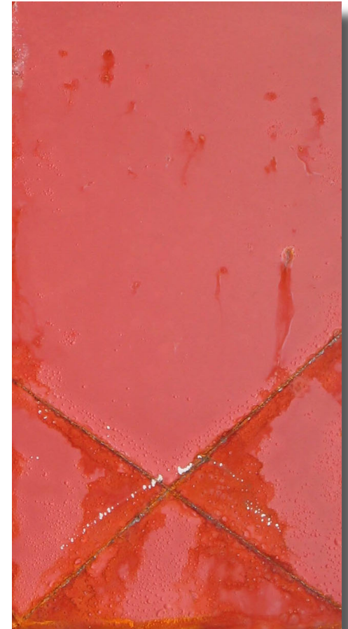
5% 391 JM